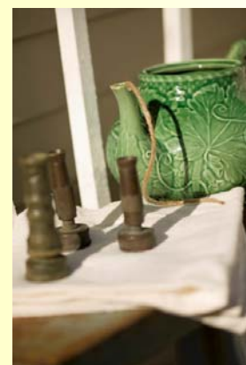
A much-loved little tea pot is a clever way to keep garden twine at hand in an outdoor setting.