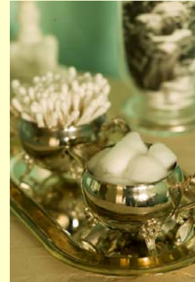
An antique cream and sugar set is the perfect powder room accent.

Thrift stores are a natural destination for inexpensive secondhand items that can be easily revamped into ingenious new creations.