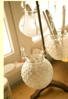
Old glass light globes are a stylish way to store serving utensils while entertaining.