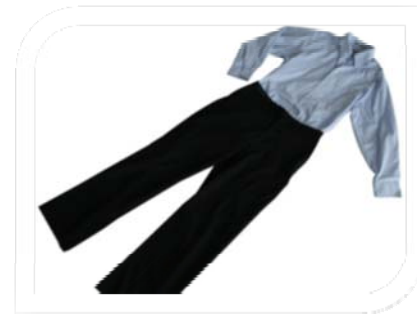
Classic striped dress shirt and navy slacks picked up at Savers/Value Village for just $20 (USD).

Men's styles will stay classic this year, and nothing beats a crisp pair of slacks and basic button down – both of which are thrift store abundances among top brand names. Classic preppy styles like striped shirts and pinstriped pants will keep guys looking dapper, and their wallet looking full.